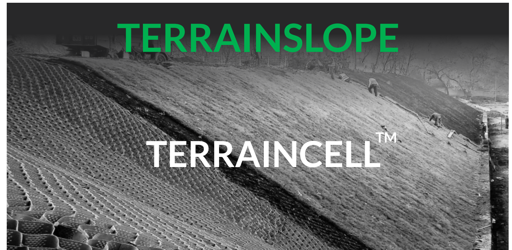
OPTIMIZED SOLUTIONS FOR SLOPE EROSION PROTECTION